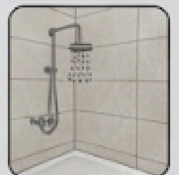
INDOOR WALL (WET AREA)